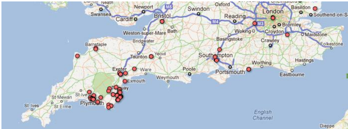
Figure 3: Geographical location of event attendees 1

The principle objective of the Pulling Together Event was to encourage collaboration within the maritime sector in Devon. The University of Chichester were invited to attend to facilitate initial discussions about the potential role of a Devon Maritime Cluster in delivering long term sustainability for the maritime industries in the region. The aims of the workshop session run by the University of Chichester were to enable the attending businesses and stakeholders to highlight and discuss common goals, identification of potential barriers and their solutions, and facilitate the process of knowledge exchange and collaboration within the sector.